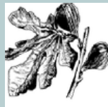
Fig & Spice